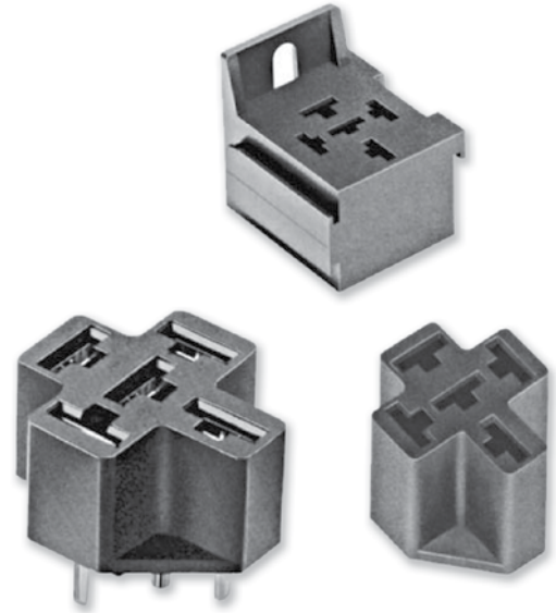
BR SERIES - 5 Pin Automotive Relay Socket

To the right is a view of the other standard products we offer in the automotive line of connectors and sockets. We offer a variety of form factors including wire harness, flange mount, and PC board mount. All made to meet or exceed the standards in the transportation market. From the Micro VR, through the ISO Standard BR, to the High Current PR, Custom Connector's Series of Connectors are the best value on the market.